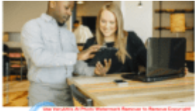
Use VeryUtils AI Photo Watermark Remover to Remove Copyright Watermarks from Adobe Stock and ...