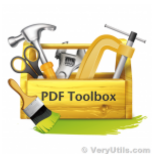
PDF Stamper and Watermark Options in PDF Toolkit Command Line software