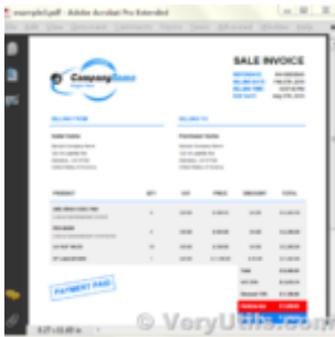
Generate business invoices by VeryUtils PHP Invoice Generator