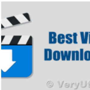
VeryUtils Total Video Downloader PHP Script allows you to download videos from 40 websites