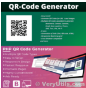
What benefits can I get from QR Code Generator software?