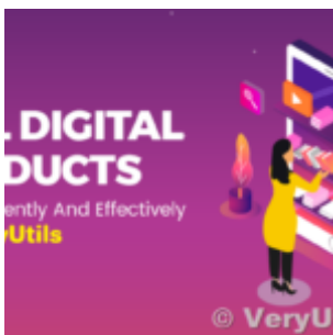
VeryUtils: A Digital Product Trading Platform