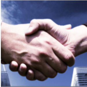
Partner with VeryUtils