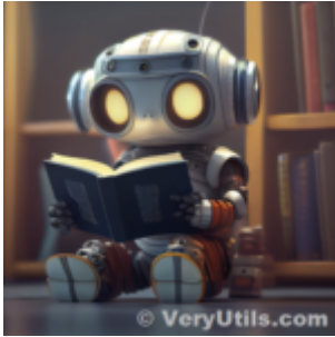
Introducing AiLab's Custom Development Service for ChatPDF SaaS Project