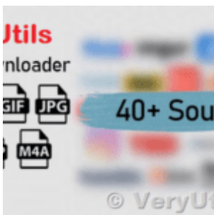
VeryUtils All in One Video Downloader Script