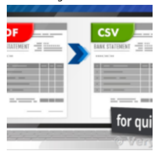
PDF to CSV Converter Command Line

Create a Digital QR Code Menu to enhance guest experience with a touchfree dining