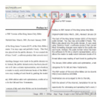
OCR TIFF to Text File using VeryUtils ScanOCR software