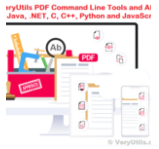
Java PDF Library -Developing PDF in Java, Create Read Modify Print Convert PDF Documents in Java