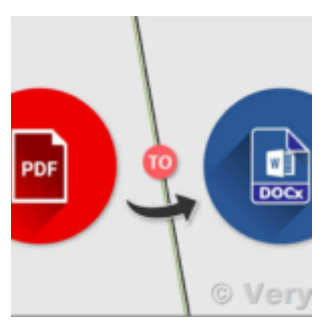
PDF to Word Converter SDK Royalty Free for Windows and Web Developers