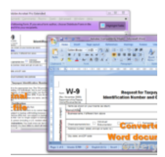
PDF to Word Conversion SDK