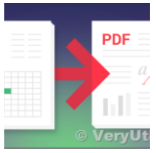
VeryUtils Excel To PDF Converter Command Line for .NET without MS Excel application