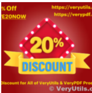
Enjoy a 20% Discount! Use the SAVE20NOW Coupon to Purchase VeryUtils Software Now!