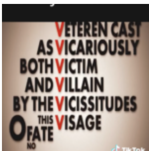
How many Vs can you count?