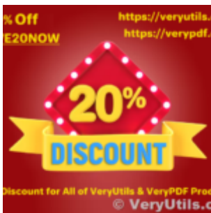
Enjoy a 20% Discount! Use the SAVE20NOW Coupon to Purchase VeryUtils Software Now!