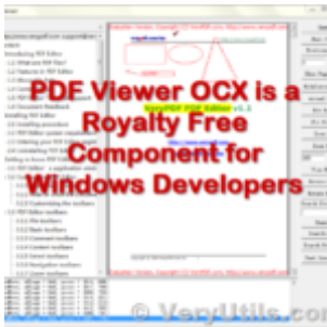
VeryUtils PDF Viewer SDK is a Fully Featured and Customizable PDF Library for Developers