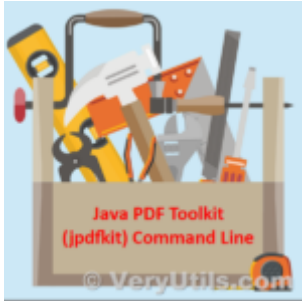
Java PDF Toolkit (jpdfkit) Command Line Examples