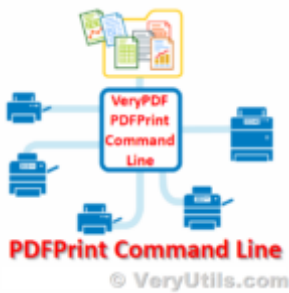
How to Batch Print PDF files from Command Line on Windows?