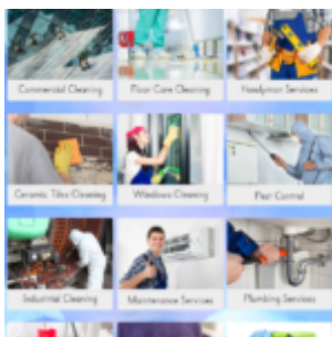
[Solution] VeryUtils Appointment Booking System: A Powerful, Flexible, and Affordable Online Booking...