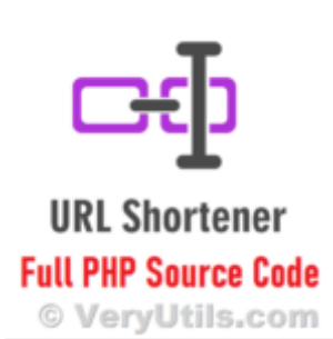
Best URL Shortener Solution by PHP URL Shortener, URL Short Link Generator