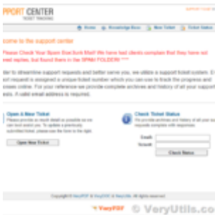
Ticket Support PHP Script