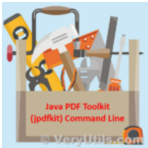
Java PDF Toolkit (jpdfkit) Command Line Examples