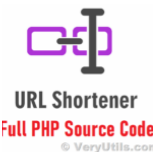
Use VeryUtils URL Shortener Without Database PHP Script to Simplify and Streamline Your URL Management...