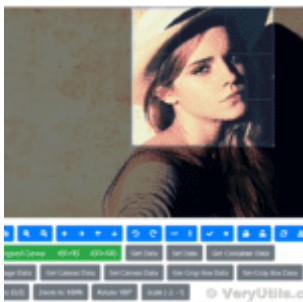
Cropping Images in JavaScript by VeryUtils JavaScript Image Cropper