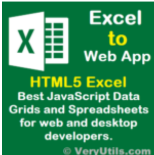
VeryUtils Online HTML5 Excel for Web Developers