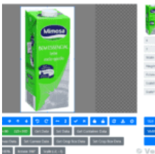
VeryUtils Image Crop and Upload using jQuery with PHP Ajax