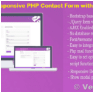
VeryUtils Responsive PHP Contact Form with jQuery AJAX