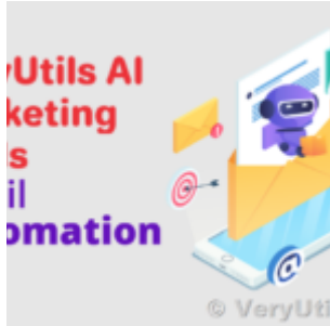
VeryUtils AI Marketing Tools to Scale Your Business in 2024