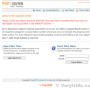
Ticket Support PHP Script