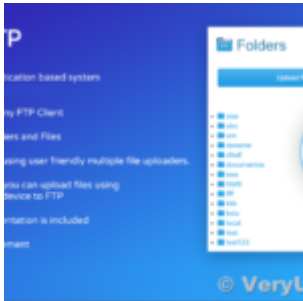
VeryUtils FTP Client Software, Automate FTP Transfers, Auto FTP Manager