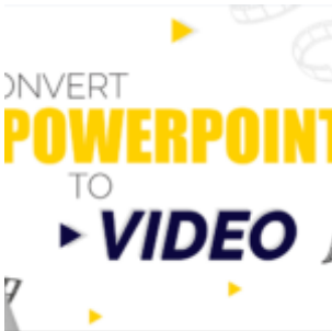
How to Convert PowerPoint to Video format from IIS Service?