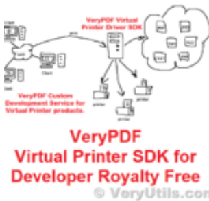
Print to PDF or Image programmatically via VeryUtils docuPrinter SDK!