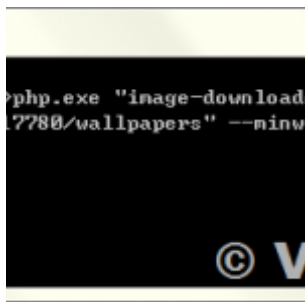
How to Scrape and Download Images from any Website by VeryUtils Web Crawler and Image Downloader PHP...