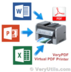
VeryUtils Virtual Printer SDK is a software development tool that can be used by developers and prog...