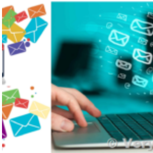
PHP Batch Email Sender - Email Marketing Software - Bulk Email Sender software