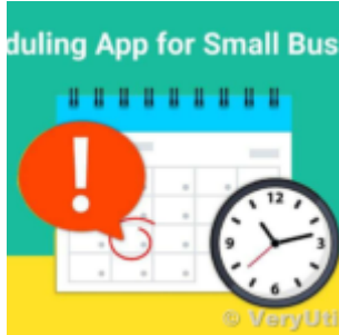
Best Appointment Scheduler software for Small Businesses