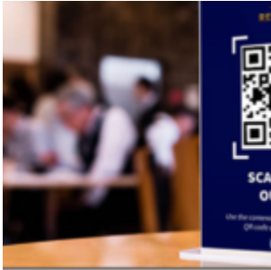
Use QR Code Menu for Restaurants to serve customers faster