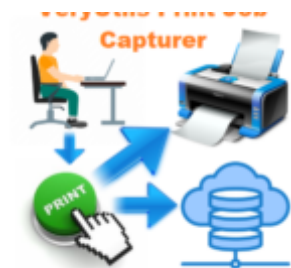
Capture Print Jobs, Convert them to PDF files, Save them to Cloud Database