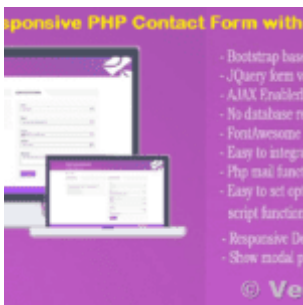
VeryUtils Responsive PHP Contact Form with jQuery AJAX